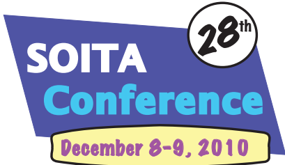
Table Display Reservation Form